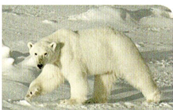
6. a polar bear 43 kph