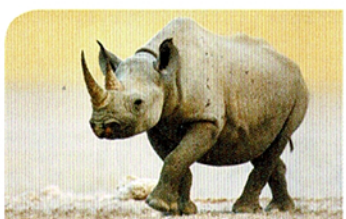
5. a rhinoceros 43 kph