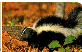
8. a skunk 12 kph