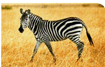
2. a zebra 64 kph