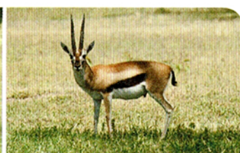
4. a gazelle 80 kph