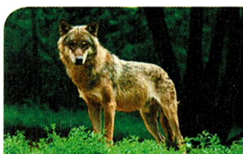
1. a wolf 64 kph

fast → as fast as → faster than slow → as slow as → slower than