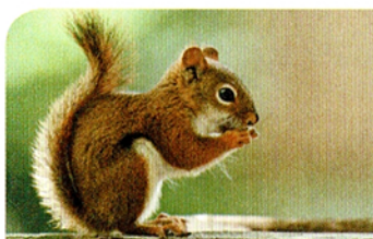
7. a squirrel 19 kph