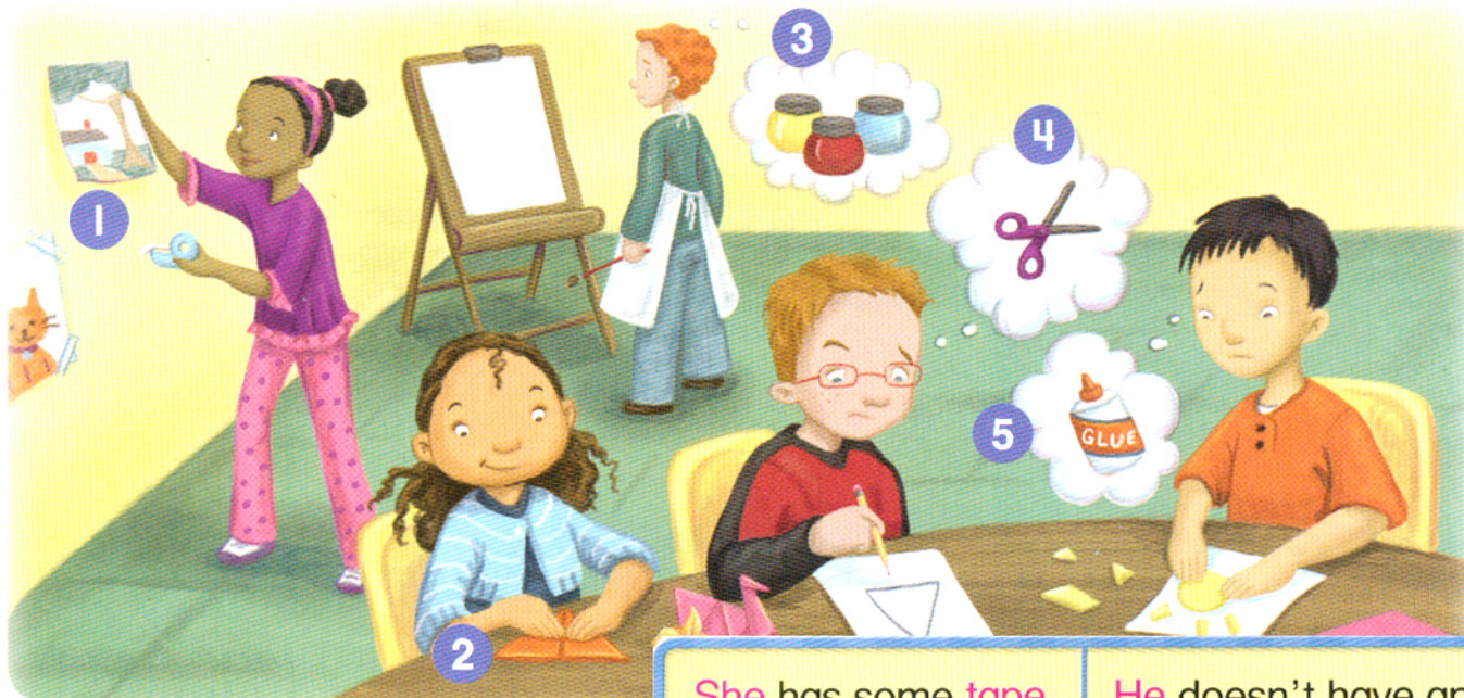
She has some tape. He doesn't have any glue.